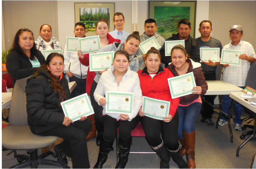
LCA English class graduates in Bend