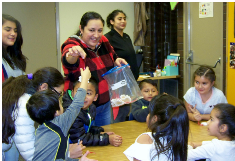
Raices after-school Spanish literacy class, Jewell Elementary, Bend 2018.