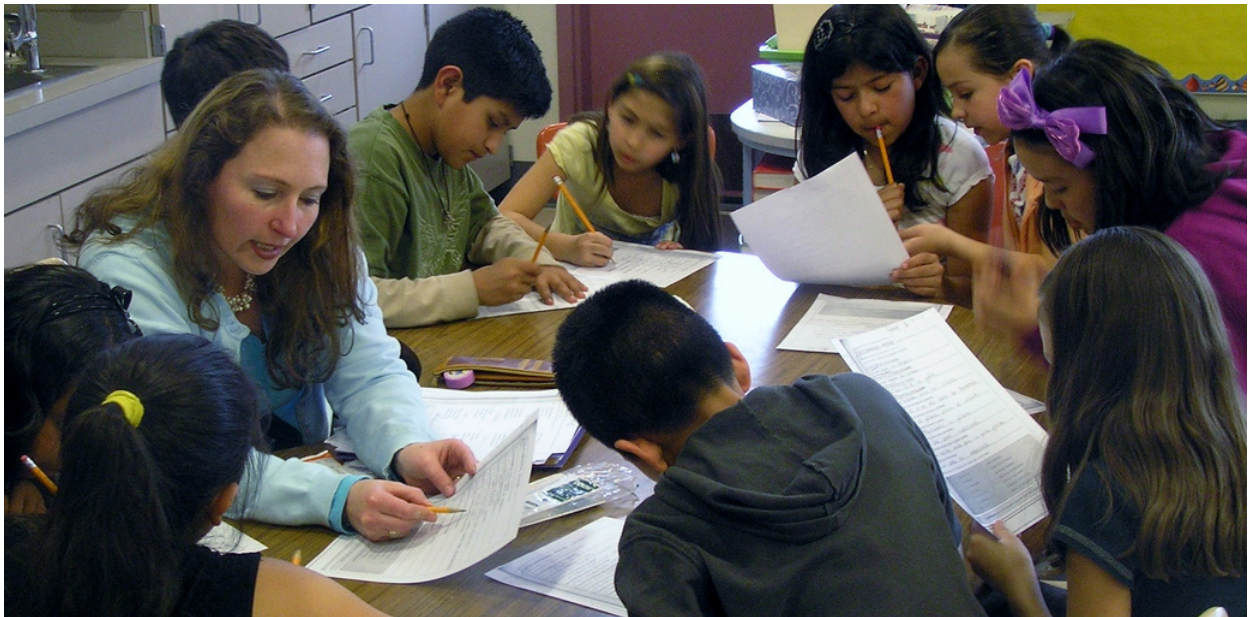
La Clase de Lectura en Español at Vern Patrick Elementary School, Redmond, 2010.

We will explore this achievement gap throughout this section, comparing differences between Oregon Latinos generally, and our Latinos residing in Central Oregon.