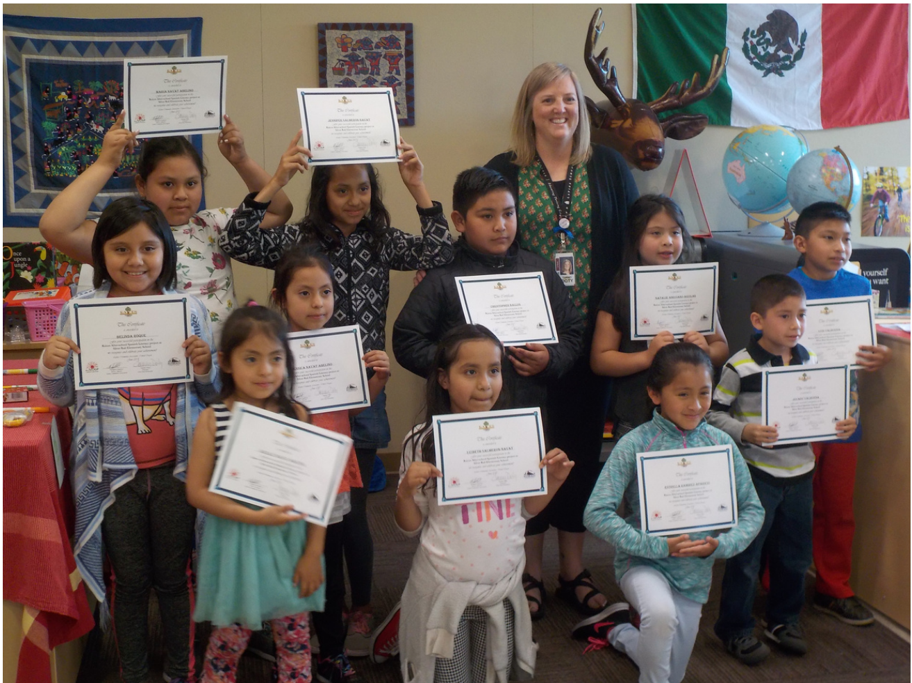
Raices Spanish literacy class graduation, Silver Rail Elementary, Bend 2017