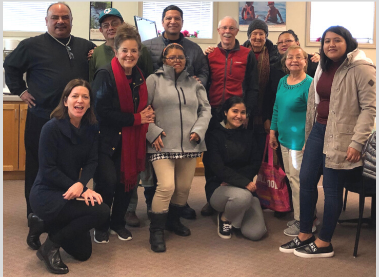
LCA English as a Second Language class in Redmond