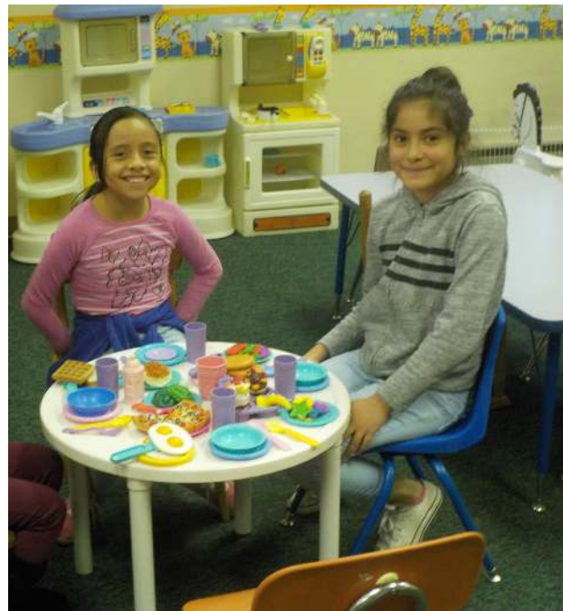
Childcare at Bend English classes, winter 2017

Oregon Dept. of Education, At-A-Glance District Profiles 2018-2019