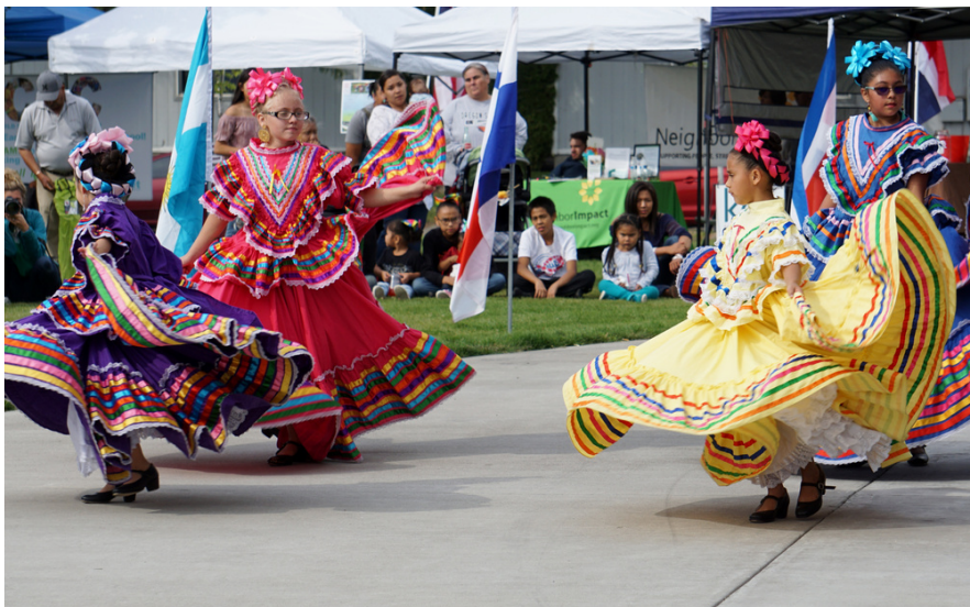
Dancers at Latino Fest 2018.

In Central Oregon, the experience of Latinos tracks closely with the history of Latinos across the state. Our footprint is smaller in this arid and more sparsely populated region compared to communities in the fertile Willamette Valley and Columbia Gorge. But we have long made substantial contributions to industries connected with the land: ranching, farming and wood products, as well as the construction, service and hospitality sectors. Many Central Oregon Latinos still feel strong connections to our countries of origin, but speak with equal pride of the years, often decades, spent making our homes in Bend, Redmond, Sisters, Culver, Madras and Prineville. Latinos bring a strong work ethic and close family ties to these Central Oregon communities. We are a youthful population who fill essential jobs, run businesses, contribute to the local, state and national tax bases, and help shore up the Social Security system.