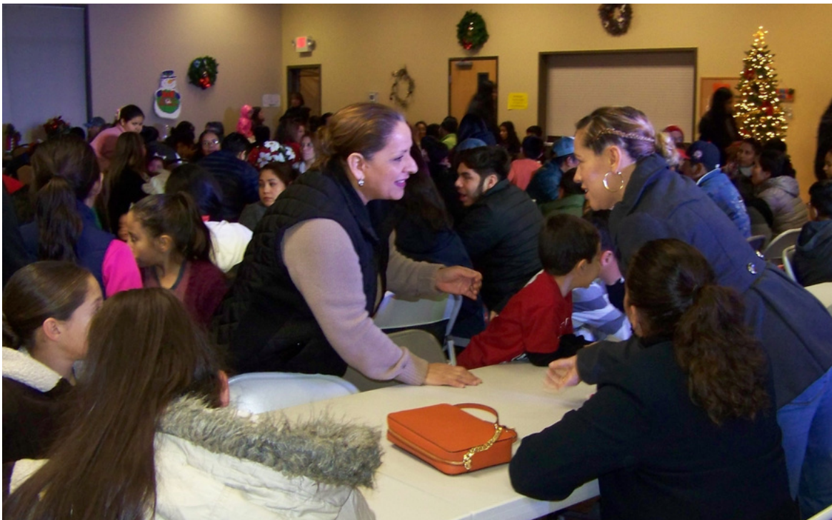
Latino Community Association's Christmas Taquiza (Taco Dinner) in Redmond 2018.